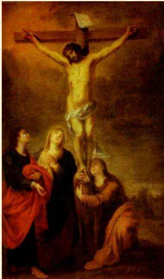
Crucifixion, Bartolome Esteban Murillo, 1675 – 1682, Hermitage Museum, Saint Petersburg, Russia