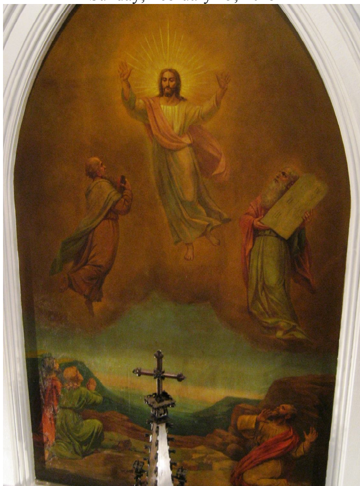
Immanuel's Transfiguration painting