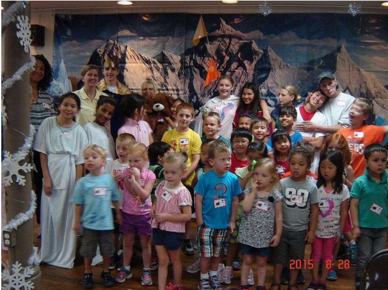
A VBS Group Photo